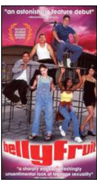
Cover for Bellyfruit video

Bellyfruit tells three separate stories, interweaving the experiences of the three main characters, Shanika, Christina, and Aracely.